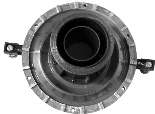
Ring radiator diaphragm for mid-range from 300 - 7000 Hz

The BMS exclusive voice coil technology employs a light weight Copper Clad Aluminium wire wound inside and outside of the Kapton™ former to improve the heat dissipation, dramatically increasing the acoustic output and reliability of the driver while minimises the power compression.